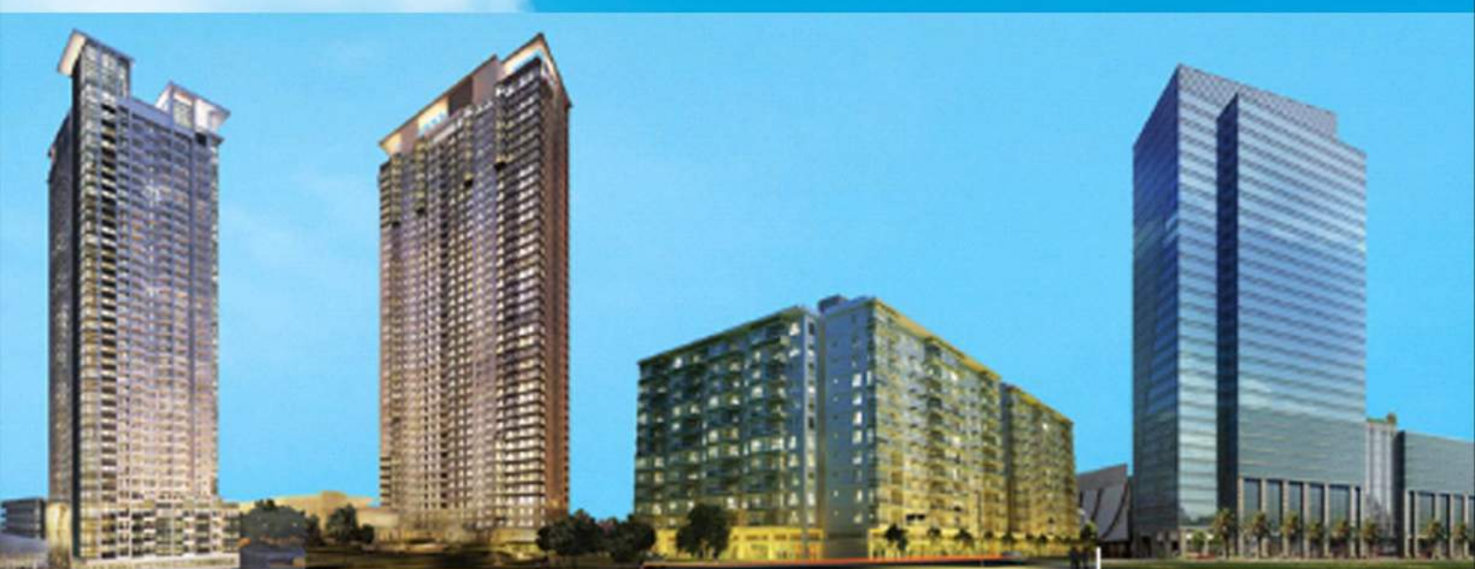
SOLSTICE CIRCUIT MAKATI

MAKATI BONIFACIO GLOBAL CITY TAGUIG PASIG QUEZON CITY CAYTE TAGAYTAY LAGUNA PAMPANGA BULACAN CDO DAVAO CEBU