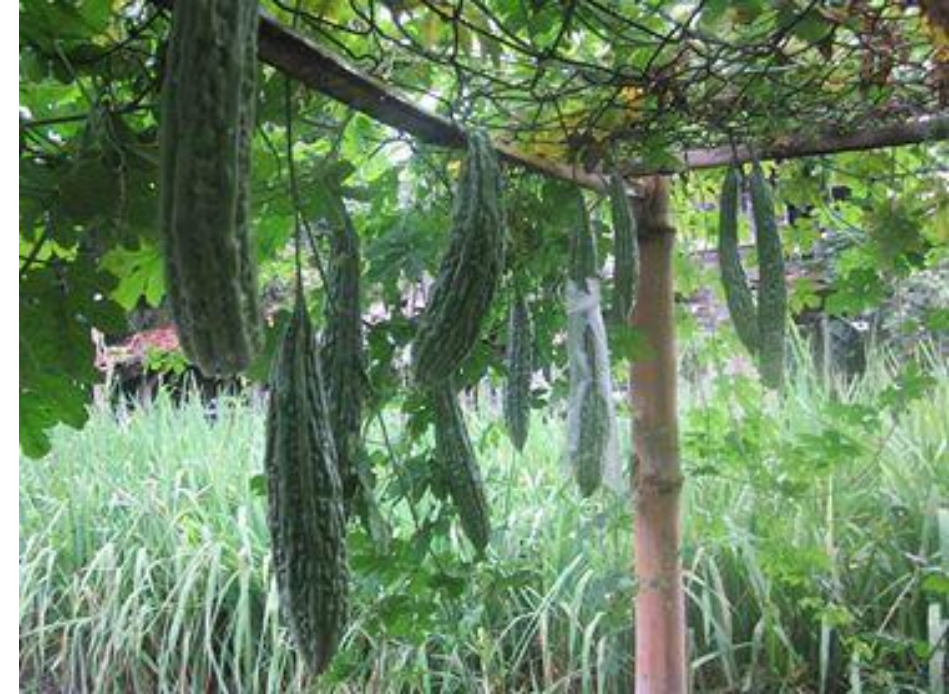
Ampalaya (bitter gourd) on Trelis with Plastic Protection