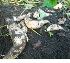
Papaya, Harvested Veggies, Muslim-Parents, Plastic Cup Seedbed