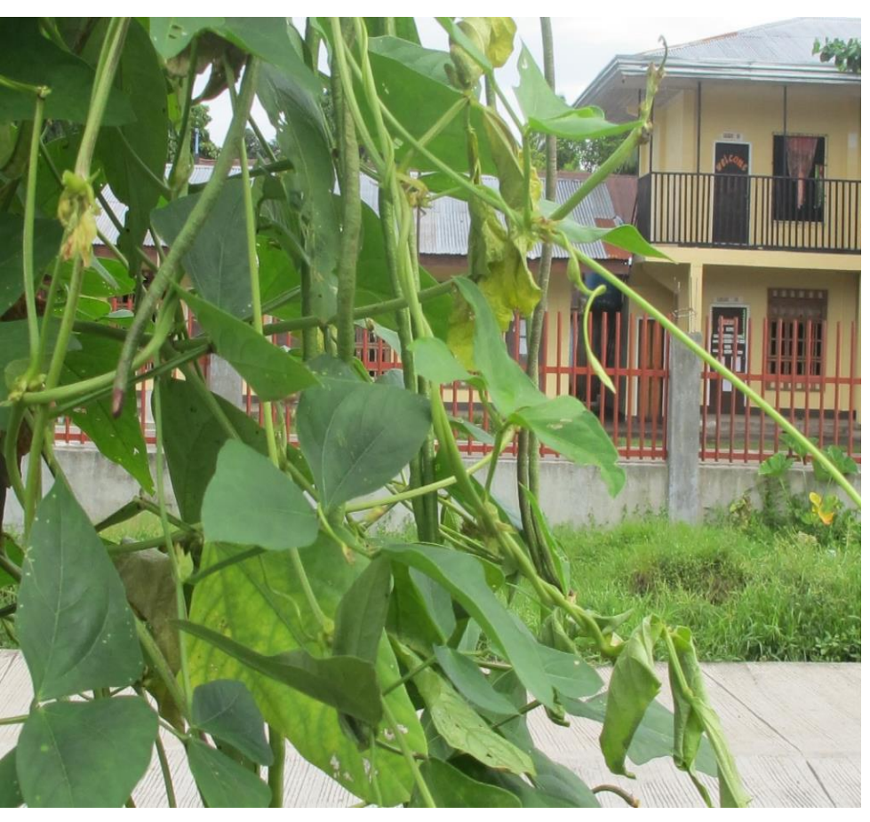
Bundling almost one-meter long beans