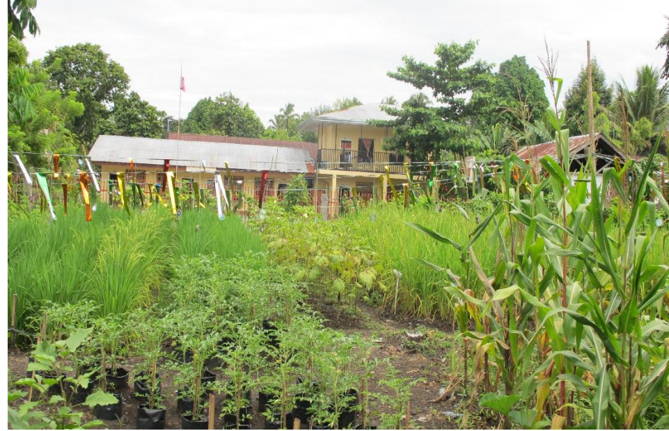
Tomato, Bordagol (aromatic rice variety) & corn