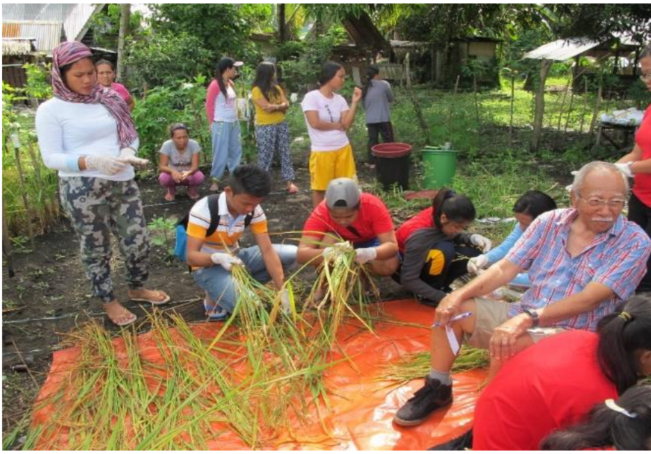
FDG & Students