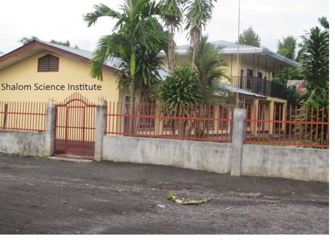
Shalom Science Institute (SSI) Banago, Balabagan, Lanao Del Sur