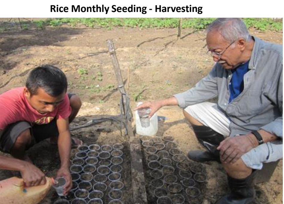
Seeding Vegetables in Plastic Cups