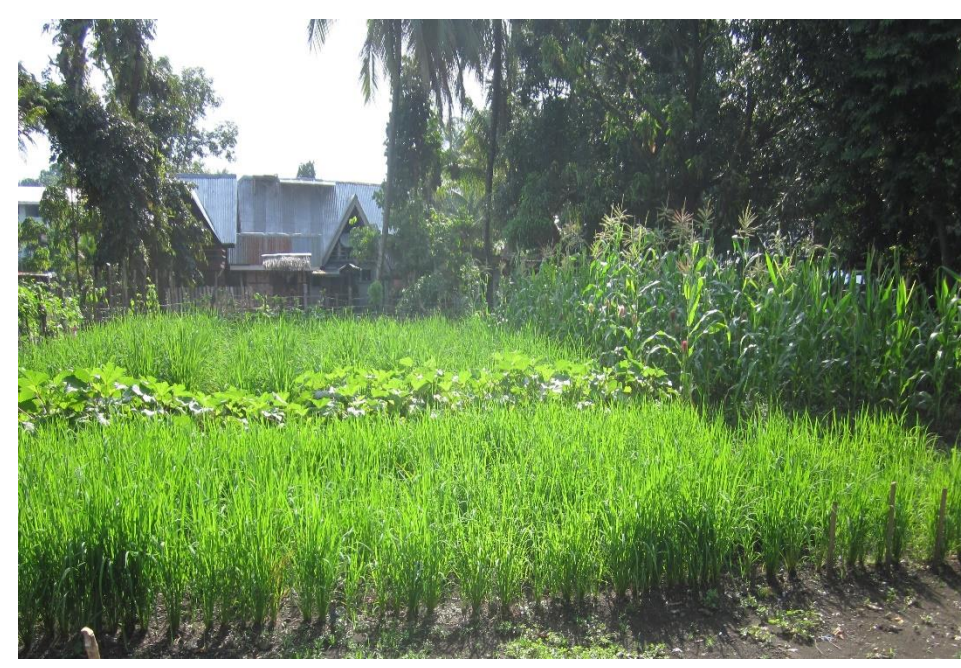
Rice, Okra and corn