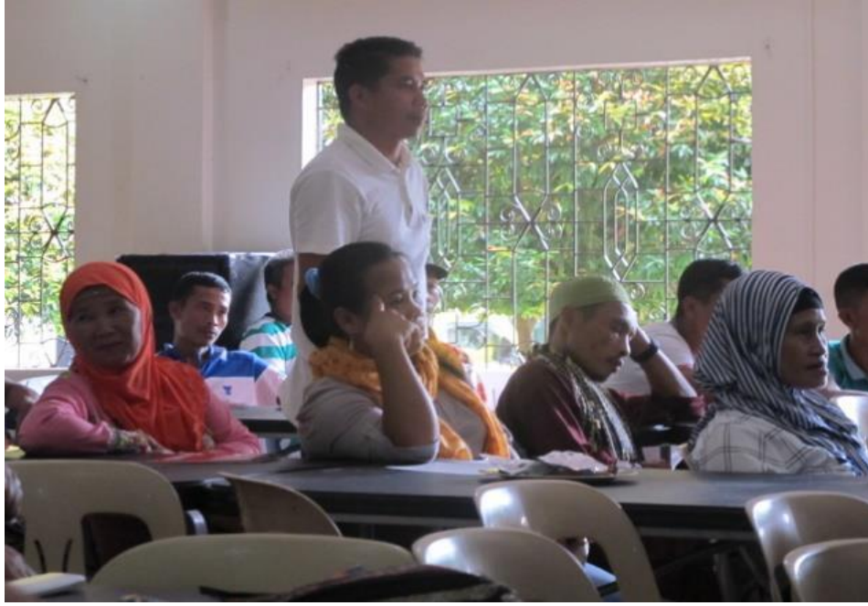
Kapatagan Seminar-Workshop attended by Muslim-Farmer-Participants